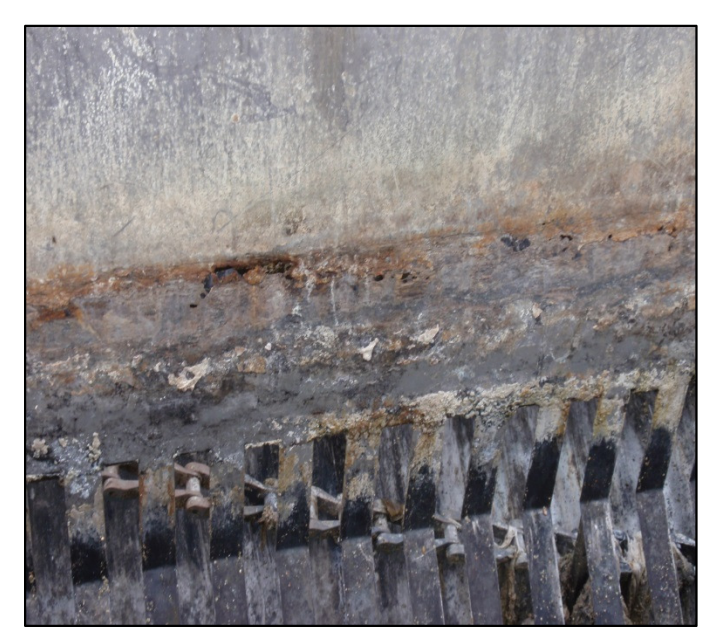
Figure 2 Stainless steel tank wall with holes resulting from MIC.

steel with a composition of 18% chromium and 8% nickel and is not supposed to corrode or rust