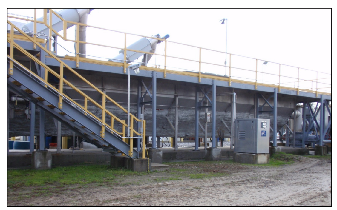
Figure 1 Above grade stainless steel headworks tank at Logan Township MUA

For Municipalities and Municipal Utilities Authorities struggling to deal with corrosion issues, knowing where to turn when faced with these challenges can be daunting. Logan Township Municipal Utilities Authority, of NJ was faced with such problems when it was discovered that a five year old stainless steel headworks tank at their wastewater treatment facility was experiencing extreme Microbiological Induced Corrosion (MIC) at the waterline with corrosion severe enough to open holes through the tank wall. Furthermore, the 304 stainless steel tank was no longer covered by the tank manufacturer's warranty and the manufacturer didn't offer any satisfactory solutions to rectify the corrosion issues. The problem became even more complicated for Logan Township MUA when a selected lining system was discontinued by the coatings manufacturer just one week before the installation was to take place. Unsure of where to go next, Corrosion Technology Systems, Inc., manufacturer's representative for Sauereisen Inc. of Pittsburgh, PA was contacted by Logan Township Municipal Utility Authority to assist the MUA in identifying an engineered solution, recommending a quality contractor/applicator and to provide on-site support to ensure the project was completed successfully.